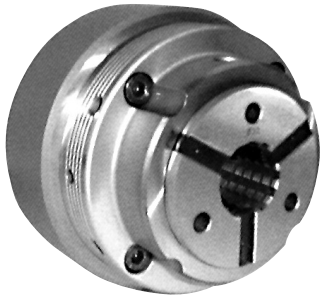
GRUPPI ACCESSORI PASSAGGIO "PEL" OPTIONAL KIT WORKPIECE CONTROL